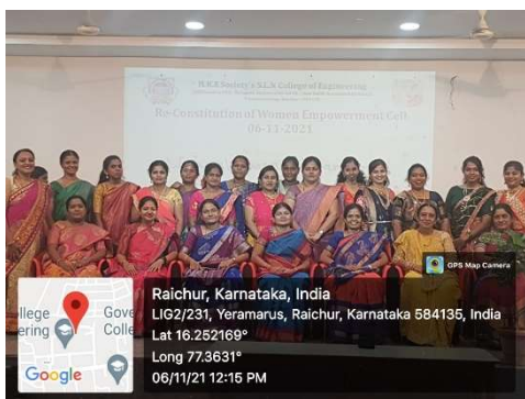
Members of Women Empowerment Cell