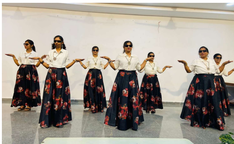
Performance by Lazy Dance Team